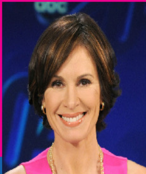
ELIZABETH VARGAS Anchor, A&E Investigates and Award-Winning Longtime Anchor, ABC News

Thursday, May 16, 2019 Kingswood Oxford School, West Hartford