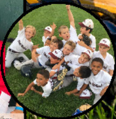
WHYBL All Stars Experience Dreams Park in Cooperstown, NY